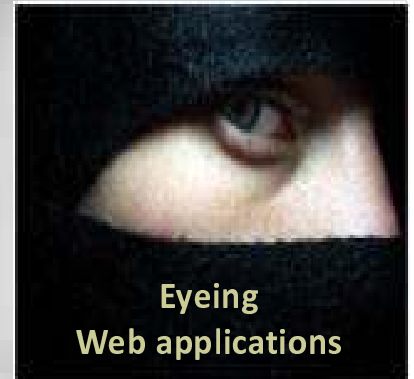
Eyeing Web applications