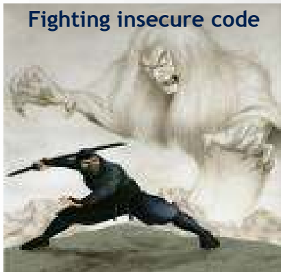
Fighting insecure code